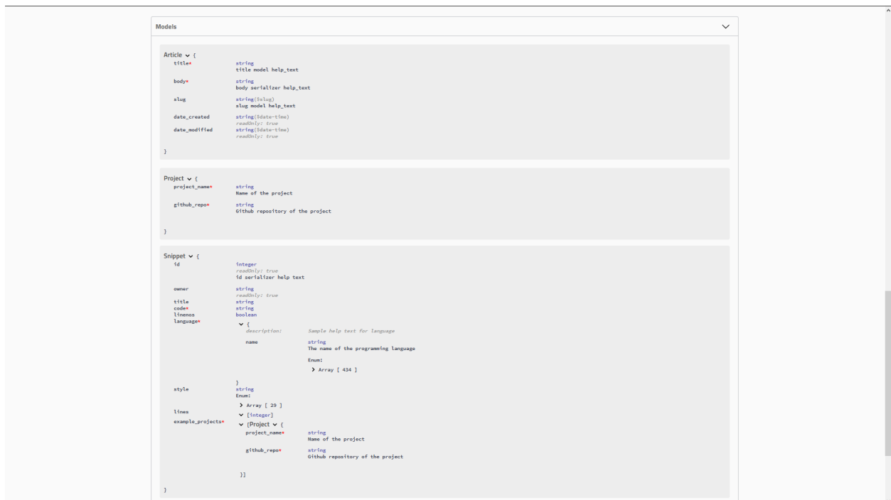
Fig. 3: Real Model definitions.